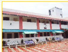
GENERAL & SPECIAL