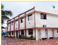
DINING & YOGA